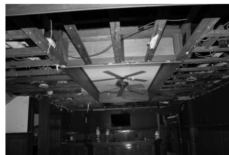
A burst sprinkler pipe caused three feet of water to flood the Phi Phi basement during the holiday break. This shows the damage to the ceiling. Find more pictures of the damage in the photo albums on our web site.

We will not have sufficient funds available to begin renovating the basement until insurance money is received. I am calling on you to make your commitment to the Centennial Capital Campaign today to help us overcome