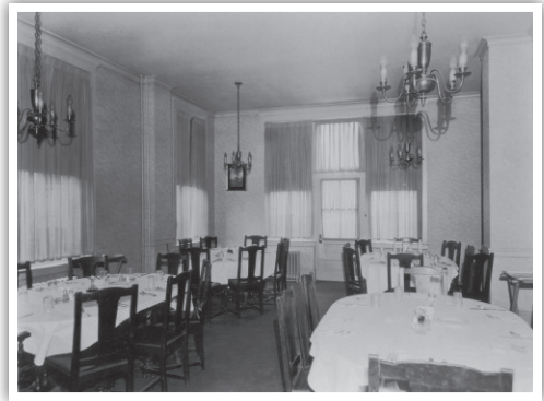
In this photo: The dining room in the 1920s.

As we approach the 100 th birthday of our chapter house in 2017, we are seeking great historical photos of the facility itself and the countless memories that have been made within its walls in the last 100 years. Please send photos from your era to our editors at content@affinityconnection.com or mail them to the return address on this newsletter (include your name and "AXP Penn" in your correspondence). You can also share photos at www.phiphiclub.com , where you can also view and comment on others' submissions.